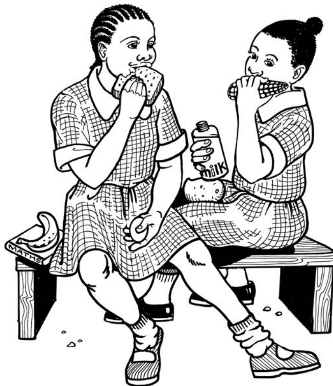
Figure 11. School-age children need good food in the middle of the day

Some children, especially adolescent girls, need to know that it can be dangerous to 'diet'. It is better to stay slim and healthy by eating good foods and being physically active.