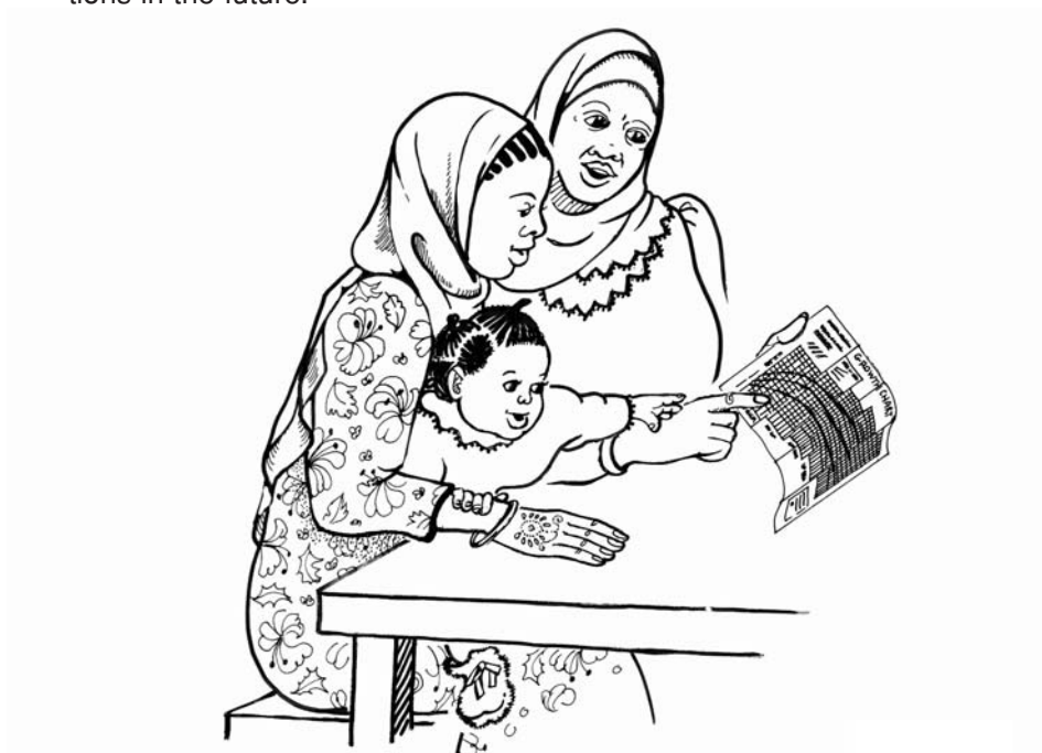
Figure 14. Checking that children are growing well by weighing them often