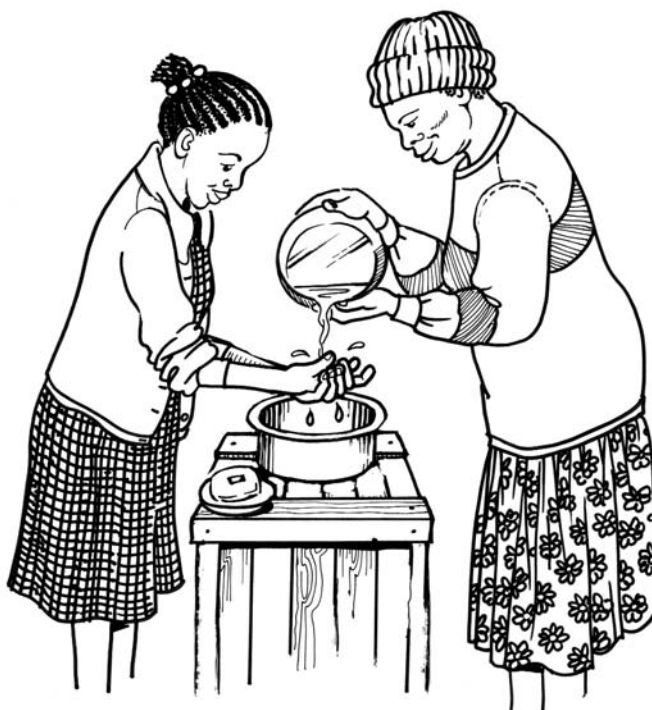
Figure 7. Washing hands helps prevent disease