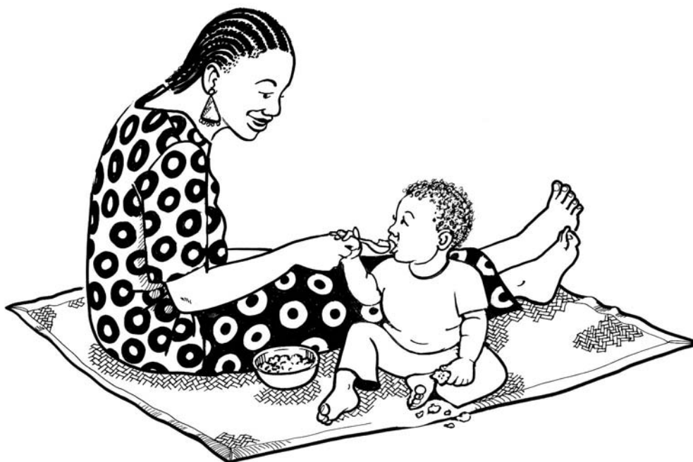
Figure 10. Actively encouraging a young child to eat

For more information on complementary feeding see: WHO. 2000. Complementary feeding: family foods for breastfed children (listed in Appendix 3).