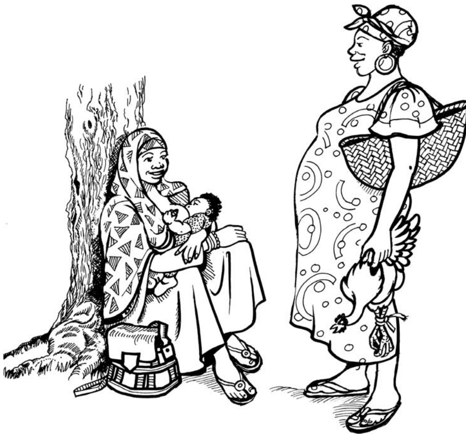
Figure 8. Women need extra food when they are pregnant or breastfeeding

At certain times some women may need micronutrient supplements in addition to good meals. For example, most women need iron/folic acid tablets during pregnancy. A good diet should provide enough of the other micronutrients, including vitamin A. However, in situations where vitamin A is likely to be deficient, women should receive vitamin A supplements as soon after delivery as possible and not more than six weeks later . This provides a store for use during breastfeeding. Do not give high doses of vitamin A to any woman who could be pregnant as they can harm her unborn baby.