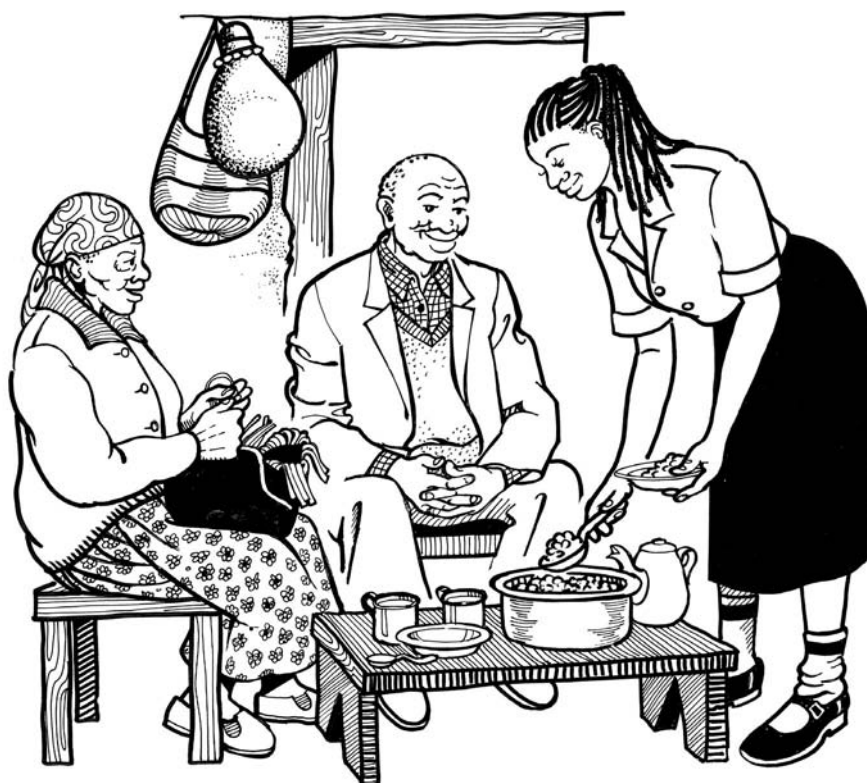
Figure 12. Helping old people to eat well

People tend to eat less as they grow older. It is particularly important that old people choose foods that are nutrient-rich so they can get enough nutrients from a smaller amount of food.